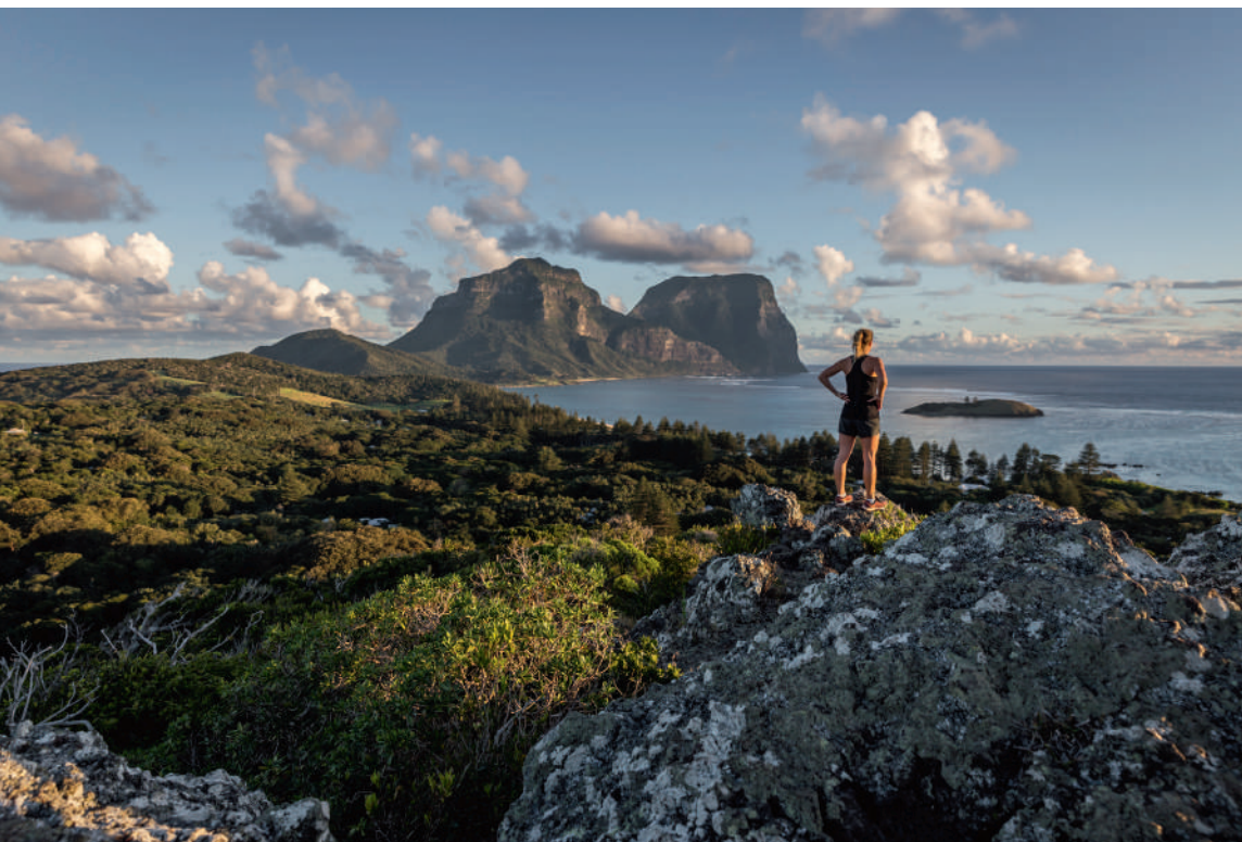
Taking time out with views of Lord Howe's southern tip

skipper Dean Hiscox will likely pluck you out of the water and drop you in again, ahead of the pack). Despite the tough conditions, I finish that day on a high, exhilarated to have gone beyond my comfort zone.