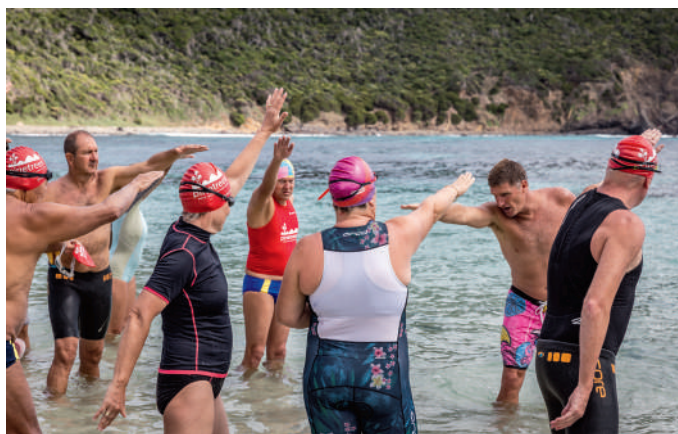
Twin peaks: Lidgbird and Gower (top); a morning masterclass with former Ironman Trevor Hendy

It's not only sharks that make us giddy; we get thrills seeing stingrays the size of a car bonnet and big green turtles drifting among the coral gardens. We slip by schools of catfish and wrasse, butterflyfish and eastern footballers. For Trevor, having a good time is the name of the game. "It's not about how well you've gone against everybody else," he says. "Let's take the competitiveness out of it and put the enjoyment in." He lives his own words; playful in the water, he sinks to the sandy seabed to try to lift a large