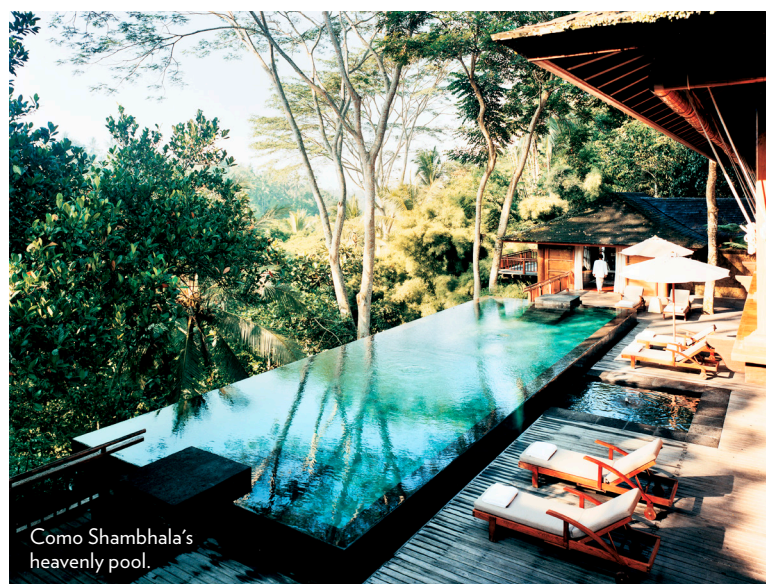
Como Shambhala's heavenly pool.