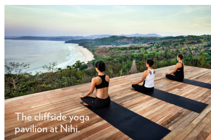
The cliffside yoga pavilion at Nihi.

From $350/night. Visit thedarling.com.au