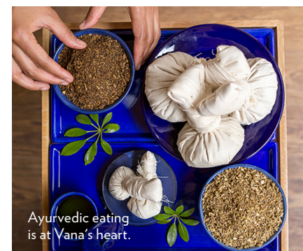
Ayurvedic eating is at Vana's heart.

As this lush retreat is found in a forest at the foothills of the Himalayas, you'd expect thatched roofs and rustic charm. But instead clean-lined architecture preludes the cutting-edge approach to wellbeing inside. A visit to Vana starts with a doctor's consultation where guests are prescribed a treatment plan of traditional Chinese medicine, Tibetan healing, meditation, Ayurveda and daily massages. But all that bliss isn't cheap. Prices start at $6600 per couple for seven days.