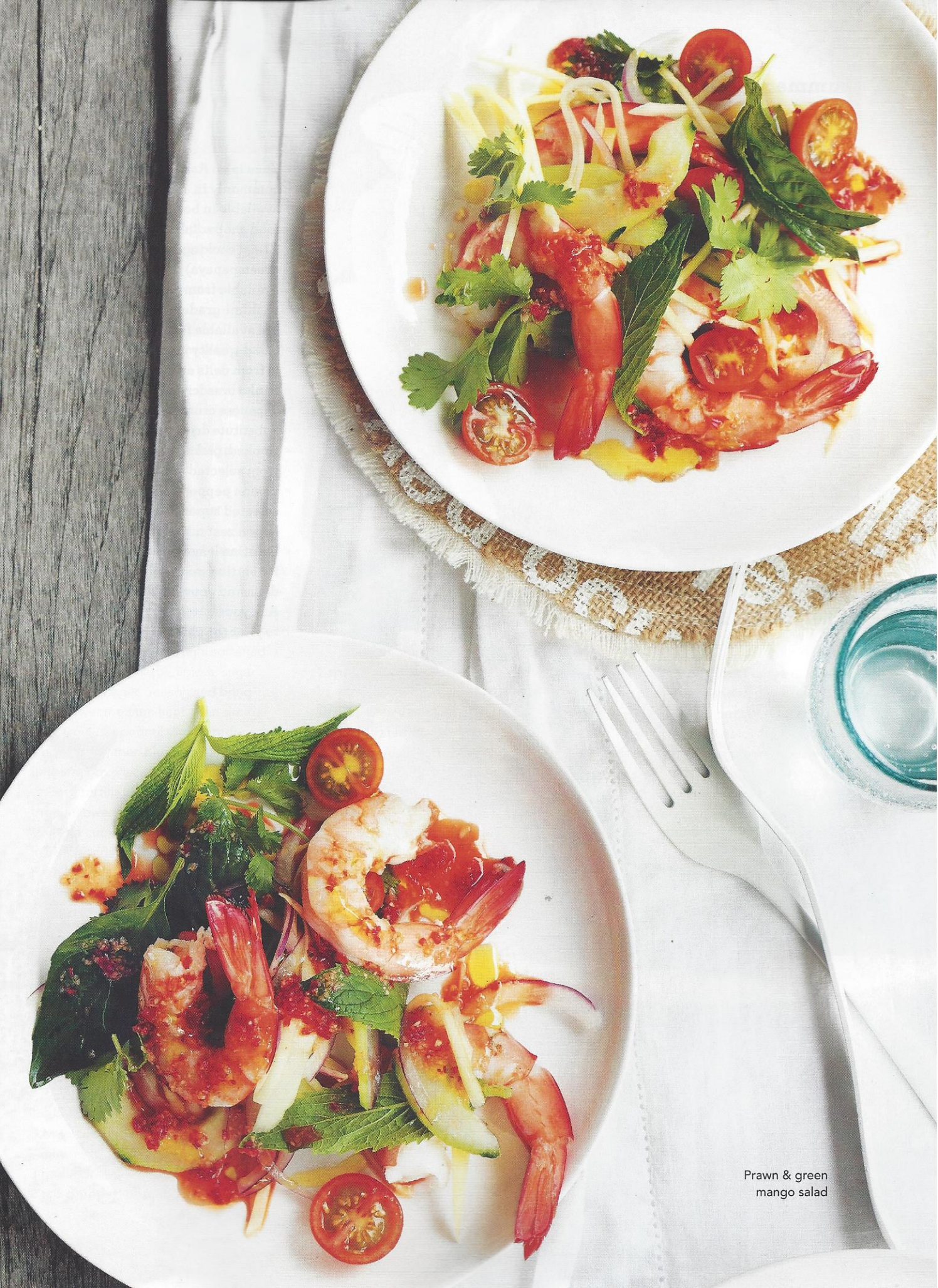
Prawn & green mango salad