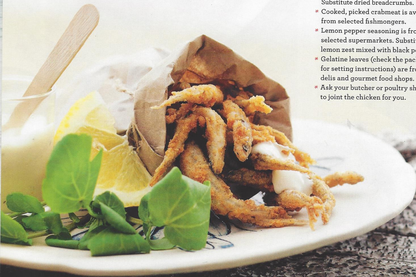
Whitebait with coriander aioli