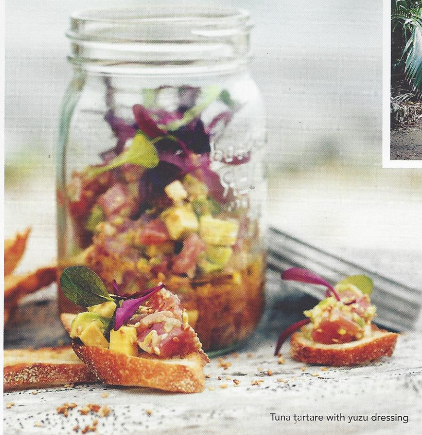
Tuna tartare with yuzu dressing