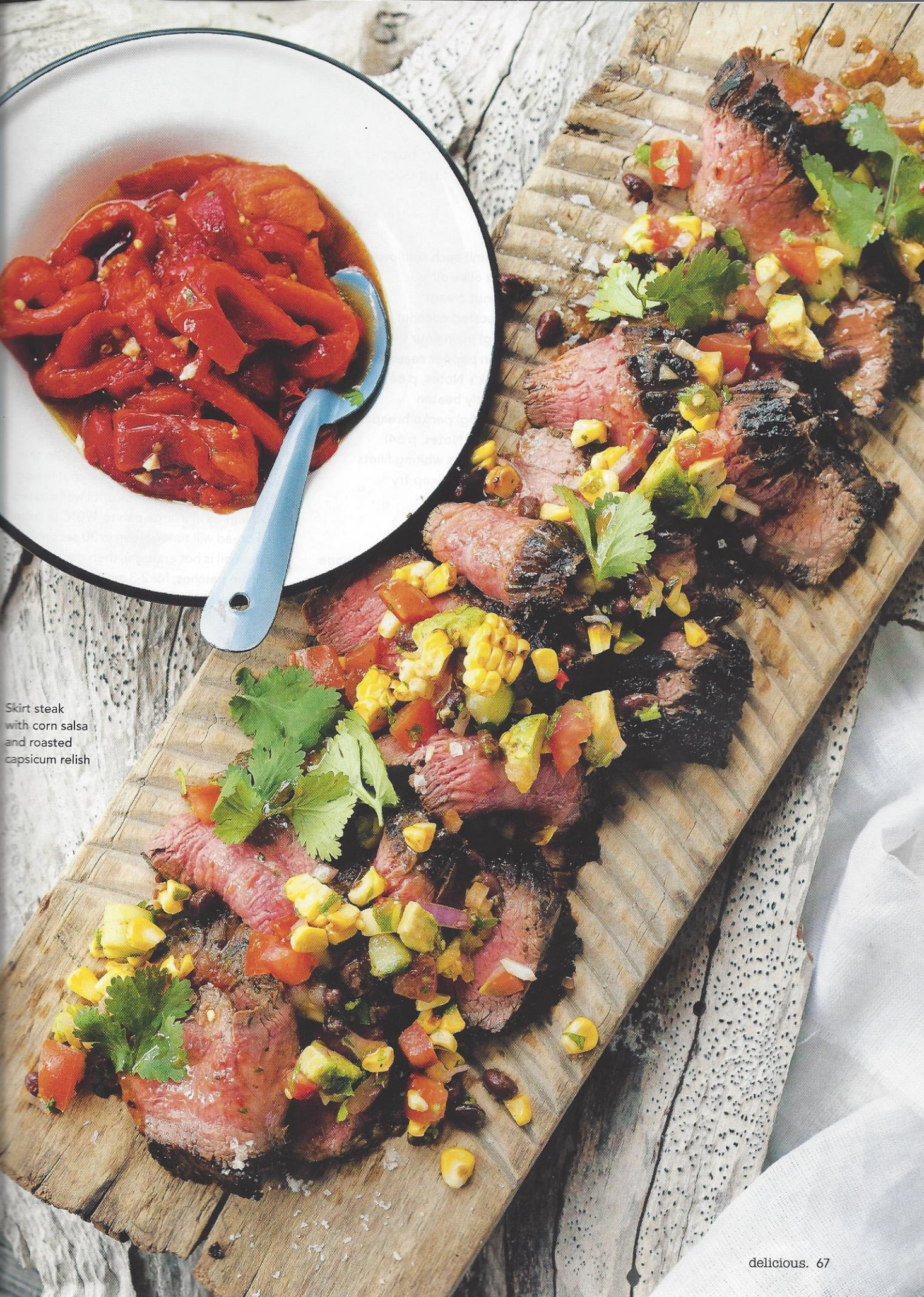
Skirt steak with corn salsa and roasted capsicum relish